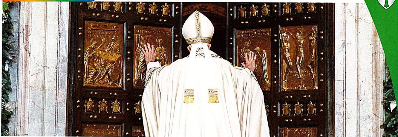
Pope Francis opens the Holy Door of St. Peter's Basilica to inaugurate the Jubilee Year of Mercy at the Vatican in this file photo from Dec. 8, 2015.

Welcome to the Jubilee Journey: Pilgrims of Hope monthly newsletter. Join us each month for ways to stay connected and to celebrate this Holy Year.